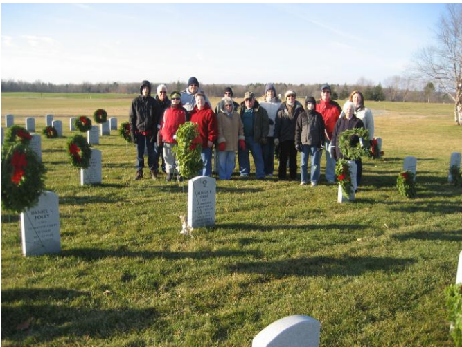
Front Row (left to right)

Note: The Schuyler Society, C.A.R. is proudly sponsored by the Gen. Peter Gansevoort Chapter NSDAR, the Saratoga Battle Chapter, SAR and the Lawrence I & Blanche H Rhodes Memorial Fund."