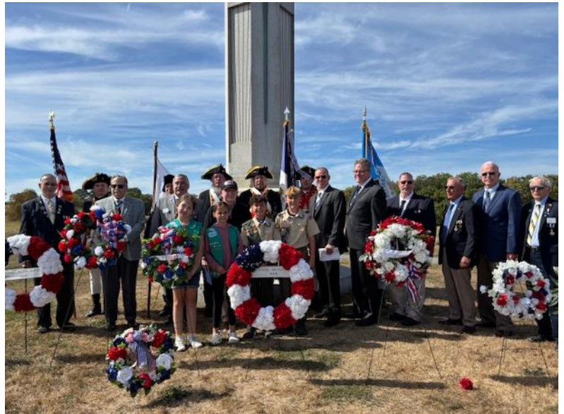
Members of the Saratoga Battle Chapter joined Boy Scouts and Girl Scouts during the memorial wreath laying event at the Daughters of the American Revolution monument in Saratoga Battlefield National Park on Sunday, September 21.