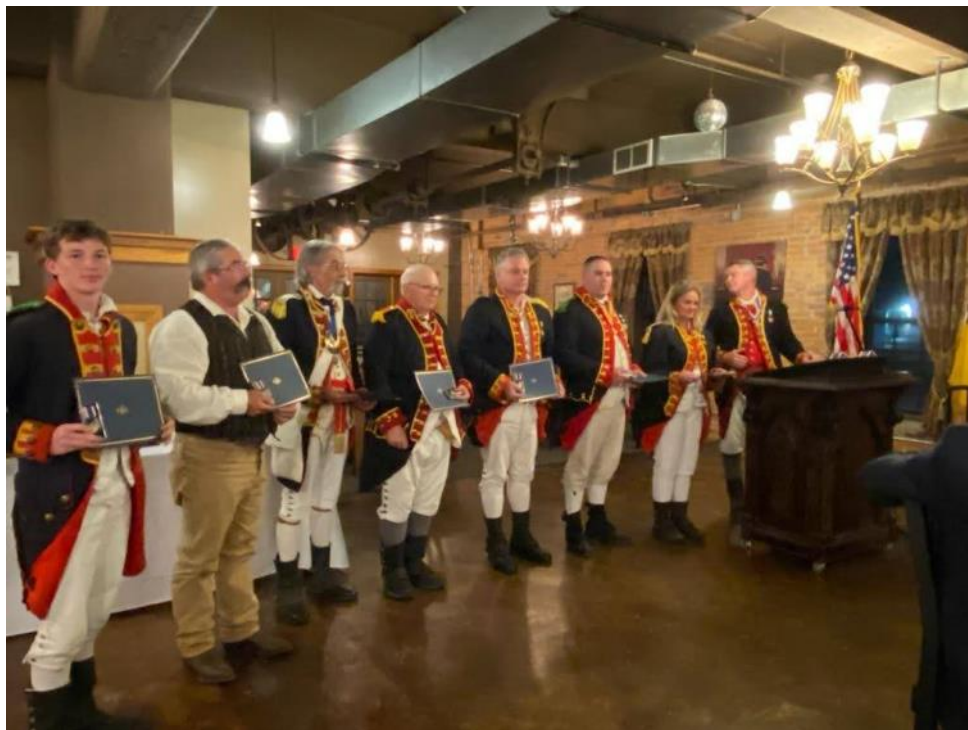
Members of the 2nd Continental Artillery Regiment received the Sons of the American Revolution 250th Anniversary Bronze Medals & Certificates during the September 17 meeting.