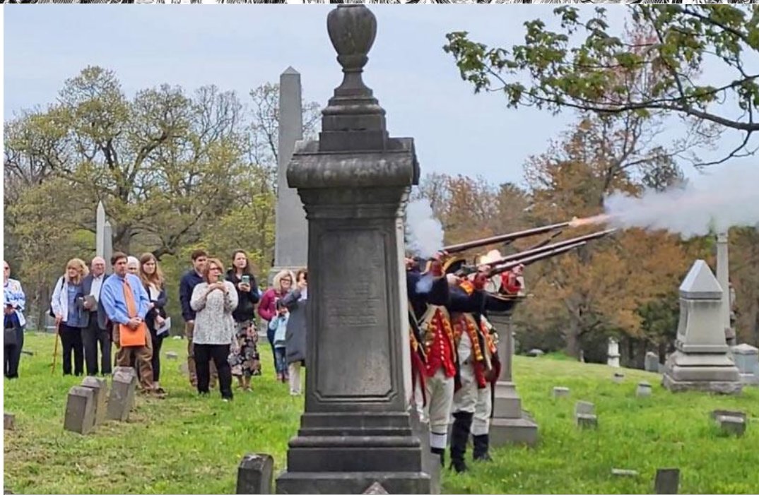
Family members observe a military gun salute by the Saratoga Battle Chapter Color Guard during a grave marker dedication ceremony at Albany Rural Cemetery in Menands.