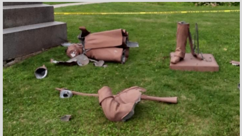
Pieces of a monument to the 77th Regiment, NY Volunteers are seen laying on the ground in Congress Park, Saratoga Springs in this 2020 image from the Facebook Page of the Saratoga History Museum .

https://charity.gofundme.com/o/en/campaign/restoration-of-saratoga-springs-77th-soldier-monument-civil-war