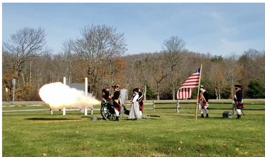
Members of the recreated 2nd Continental Artillery Regiment fired off a Revolutionary War-era cannon replica during a veterans remembrance event in Stephentown November 7.