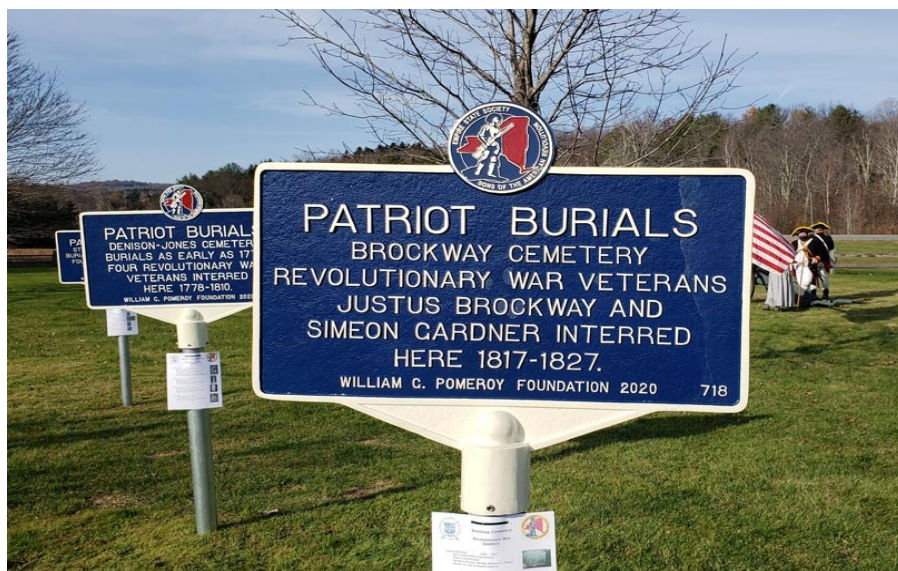
Historic markers to honor Rensselaer County Veterans of the Revolutionary War were unveiled during a veterans ceremony in Stephentown on November 7.