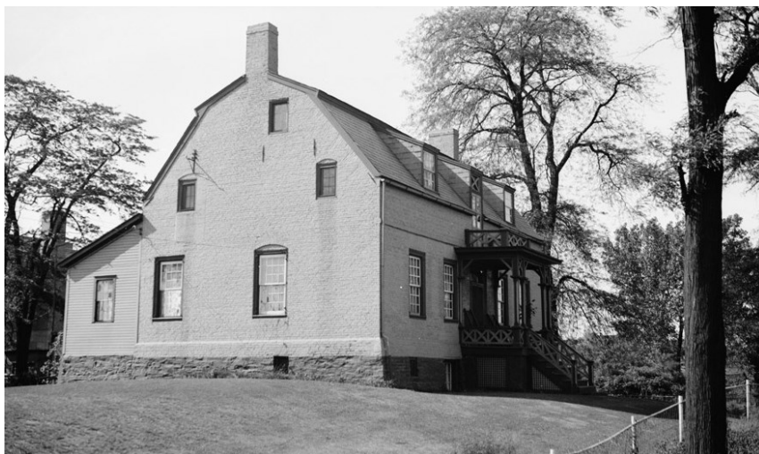
Built around 1735, VanSchaick Mansion in Cohoes served as a military headquarters during the French & Indian War and the Revolutionary War.