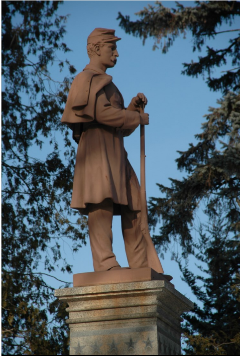
A monument to the 77th Regiment, NY Volunteers before it was destroyed in 2020.