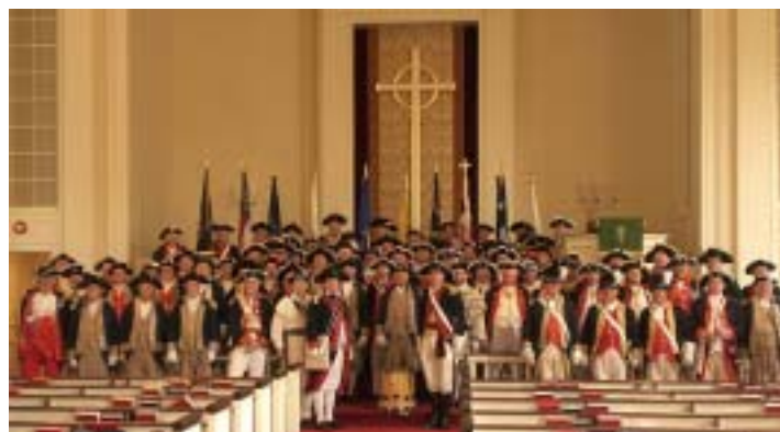
Group Color Guard Group Photo after Memorial Service