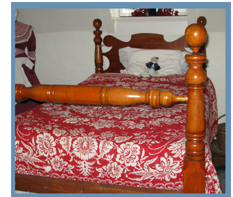
Alice B. Shelp Room upstairs in mansion