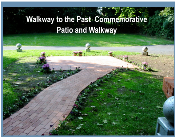
Walkway to the Past Commemorative Patio and Walkway