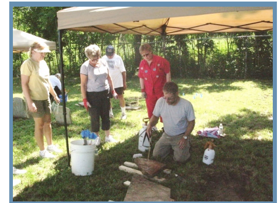
Chapter restores/repairs Van Schaick Cemetery stones