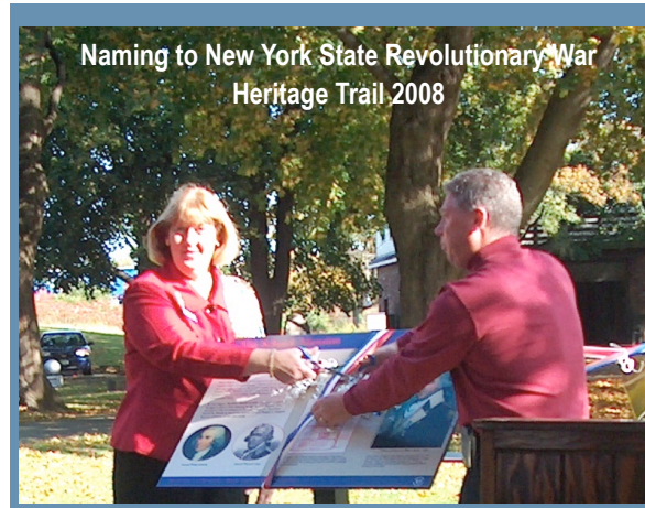
Naming to New York State Revolutionary War Heritage Trail 2008